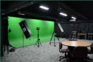
Video Production Lab