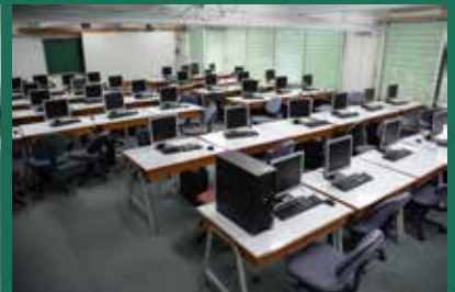
Computer Graphics Lab