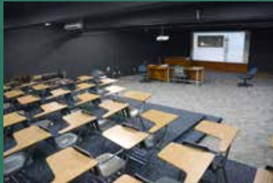
Film Viewing Studio