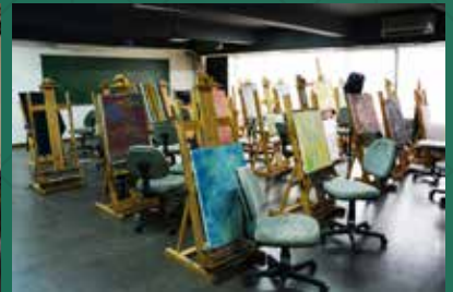
Fine Arts Studio