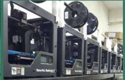
3D Modeling Lab