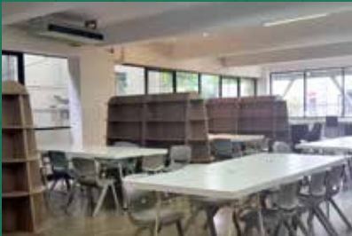
SoD 24-hour student lounge