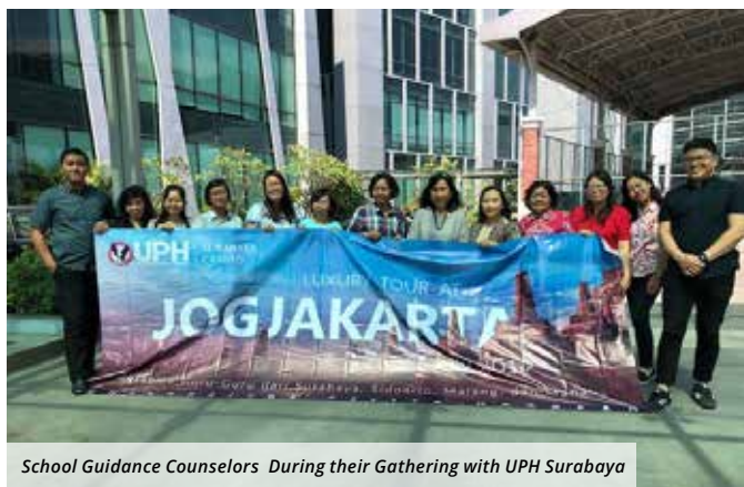
School Guidance Counselors During their Gathering with UPH Surabaya