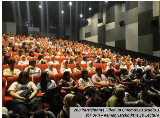
200 Participants Filled up Cinemaxx's Studio 3 for UPH – Kemenristekdikti's 3D Lecture