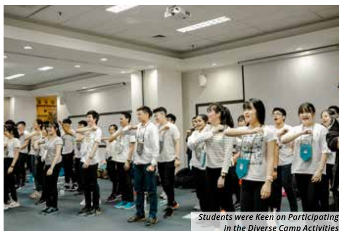
Students were Keen on Participating in the Diverse Camp Activities