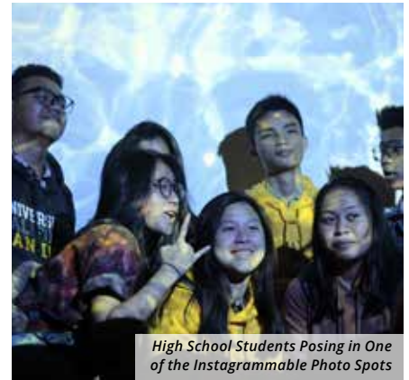
High School Students Posing in One of the Instagrammable Photo Spots

UPH utilizes the power of social media as a means of introducing its campus to high school students visiting UPH Karawaci on July 19, 2019. This event was attended by 500 11th and 12th graders from five schools across Jabodetabek.