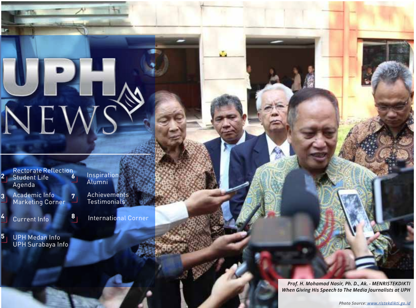
Prof. H. Mohamad Nasir, Ph. D., Ak. - MENRISTEKDIKTI When Giving His Speech to The Media Journalists at UPH