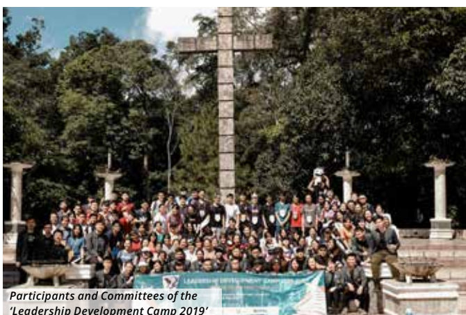
Participants and Committees of the 'Leadership Development Camp 2019'