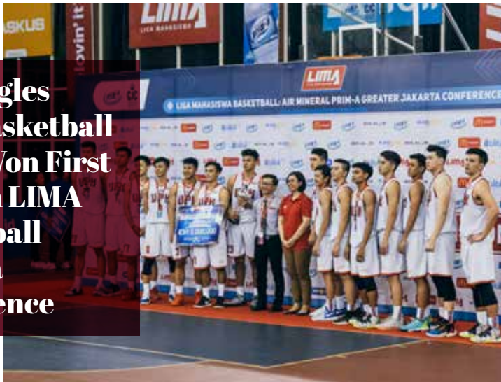
UPH's Male Basketball Team, UPH Eagles, Won 1st Place at LIM Basketball: Air Mineral Prim-A Greater Jakarta Conference Season 7, Held on July 24-31, 2019, at UPH Lippo Village Basketball Court