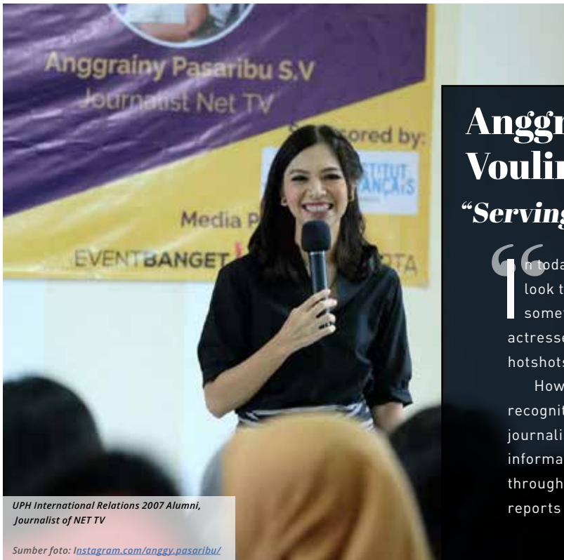
UPH International Relations 2007 Alumni, Journalist of NET TV