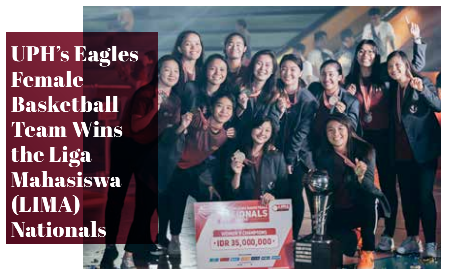
UPH's Eagles Female Basketball Team Wins the Liga Mahasiswa (LIMA) Basketball Nationals for the First Time on August 12, 2019, Beating Universitas Esa Unggul