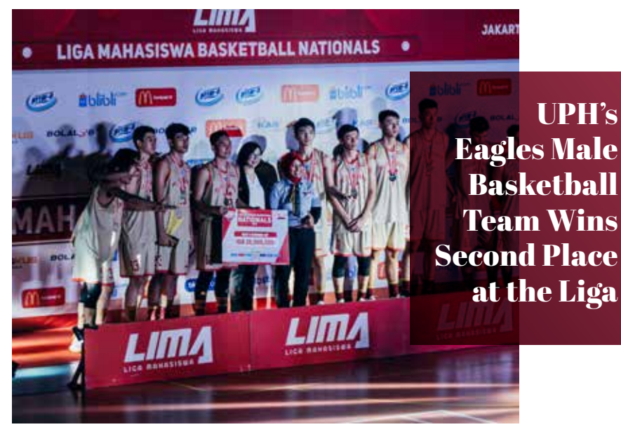
UPH's Eagles Male Basketball Team Wins Second Place at the Liga Mahasiswa (LIMA) Nationals on August 12, 2019

UPH Lands the 23th National Rank in UI GreenMetric 2018