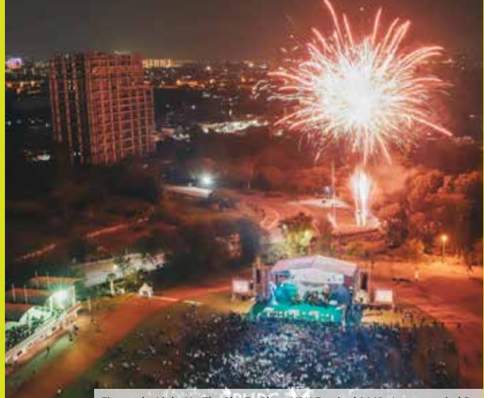
Fireworks Light Up The Sky To Close UPH Festival 2019, Accompanied By A Music Performance By UPH Conservatory Of Music