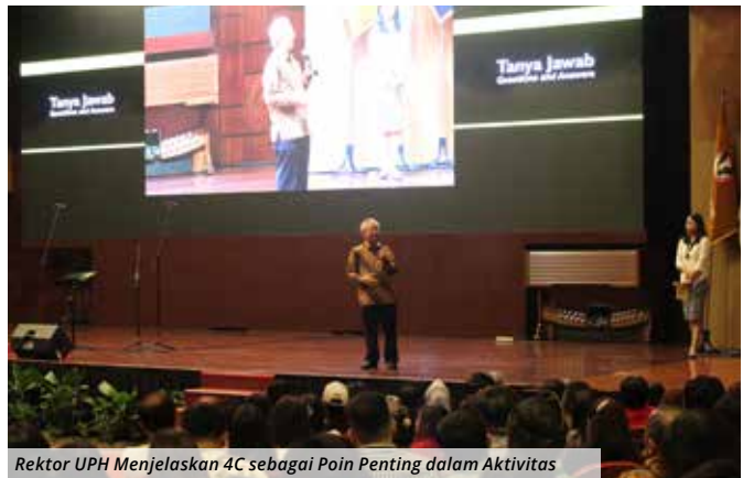
Rektor UPH Menjelaskan 4C sebagai Poin Penting dalam Aktivitas Mahasiswa dan Juga Menjawab Beragam Pertanyaan dari Orangtua

PH Festival 2019 does not only equip new students to get to know their campus – it is also a place for parents to become active contributors for their students' learning progress through effective communication with their children. This is the main message in the Parents Gathering held on August 17, 2019, at UPH's Lippo Village Campus.