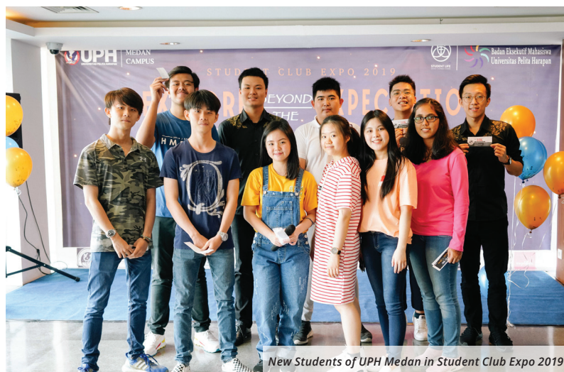
New Students of UPH Medan in Student Club Expo 2019