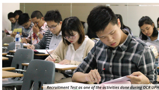
Recruitment Test as one of the activities done during OCR UPH

T he Career Center of UPH held another On Campus Recruitment (OCR) for the academic year of 2019/2020. This program was proven to be very effective and has successfully shortened the regular recruitment process for UPH graduates. Some of the companies who participated in OCR UPH, held at Karawaci Campus, were PT Ultra Prima Abadi (Orang Tua Group), and PricewaterhouseCoopers (PwC) Indonesia on September 11 and 18, 2019, PT CS2 Pola Sehat on September 27, PT Softex Indonesia on October 2, and PT Bank Samaras Tbk. on October 18, 2019.