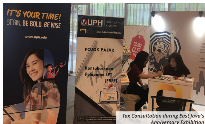
Tax Consultation during East Java's Anniversary Exhibition

On October 15, 2019, Tax Center UPH Surabaya collaborated with the Regional Office of East Java Tax Directorate General 1 to follow an exhibition for the anniversary celebration of East Java at the Dyandra Convention Center. This event was a part of the community service program in form of tax consultation. It was held from 09.00 to 21.00 and was crowded with visitors and also contestants. In this event, 11 students of the Accounting Department along with an associate from Pratama Tax Office Surabaya Tegalsari, Simokerto, and Sawahan have a free tax consultation for visitors of the exhibition. This event will provide