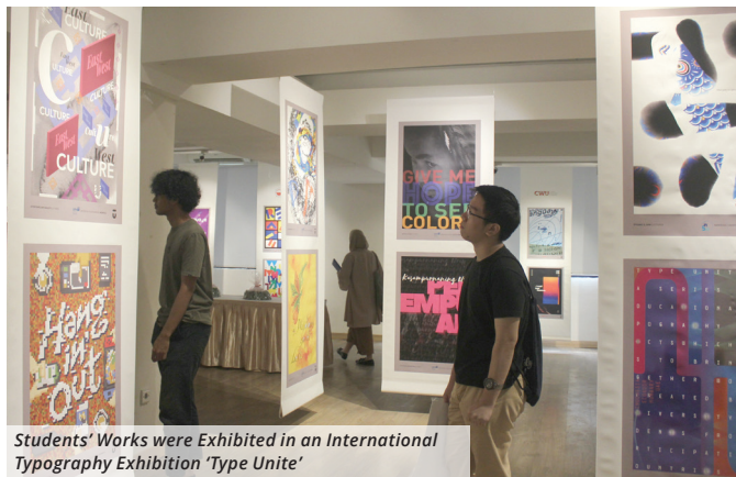
Students' Works were Exhibited in an International Typography Exhibition 'Type Unite'

UPH Visual Communication Design (DKV) has committed to ensure its quality and expand its exposure to a global scale. Various efforts have been made by the faculty to prepare its graduates to have international qualifications. One of these efforts were realized through a recent exhibition called Type Unite 'Language Relations', which was held on September 23-27, 2019 at UPH Campus, Lippo Village. This international exhibition showcased a total of 80 works by students from eight countries. Each country showcased a total of ten works, and among the chosen ones from Indonesia, six works were created by the students of DKV UPH, two came from ITB students, and two were made by Trisakti University students.