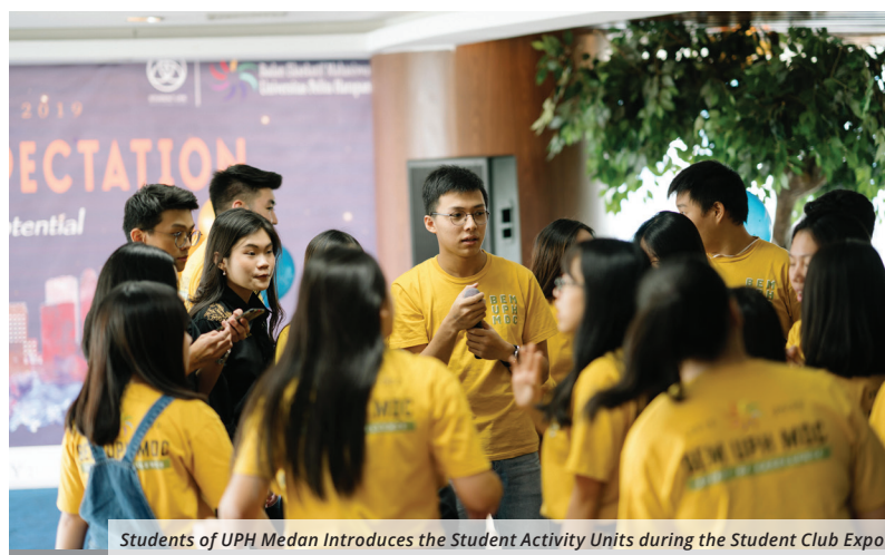
Students of UPH Medan Introduces the Student Activity Units during the Student Club Expo