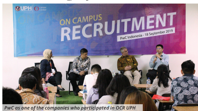
PwC as one of the companies who participated in OCR UPH