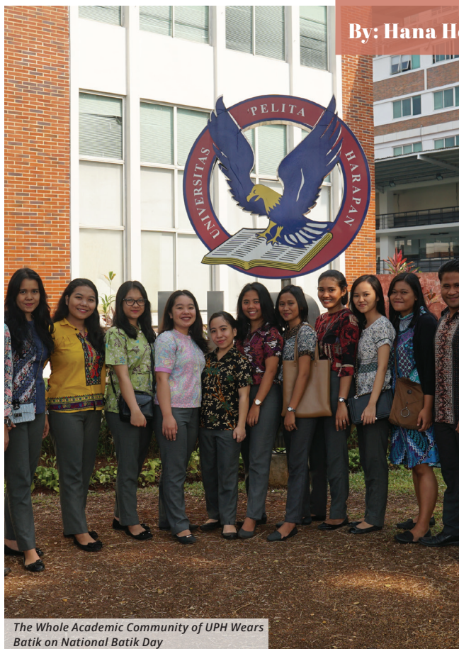
The Whole Academic Community of UPH Wears Batik on National Batik Day