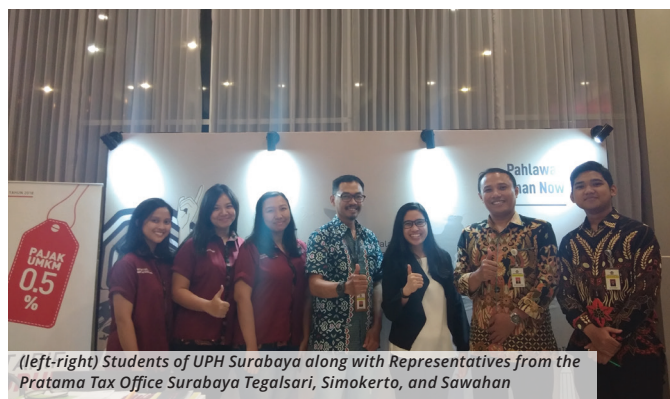
(left-right) Students of UPH Surabaya along with Representatives from the Pratama Tax Office Surabaya Tegalsari, Simokerto, and Sawahan

On October 15, 2019, Tax Center UPH Surabaya collaborated with the Regional Office of East Java Tax Directorate General 1 to follow an exhibition for the anniversary celebration of East Java at the Dyandra Convention Center. This event was a part of the community service program in form of tax consultation. It was held from 09.00 to 21.00 and was crowded with visitors and also contestants. In this event, 11 students of the Accounting Department along with an associate from Pratama Tax Office Surabaya Tegalsari, Simokerto, and Sawahan have a free tax consultation for visitors of the exhibition. This event will provide