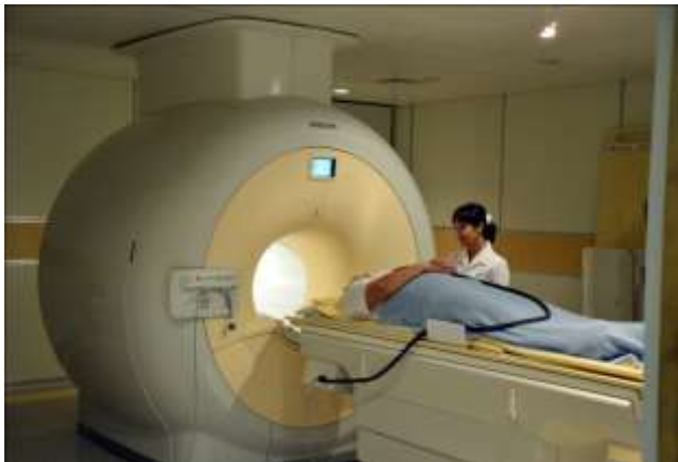
CT Scan (Up to 256 MSCT slices)