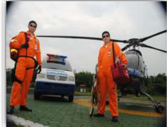
Medical Evacuation Services