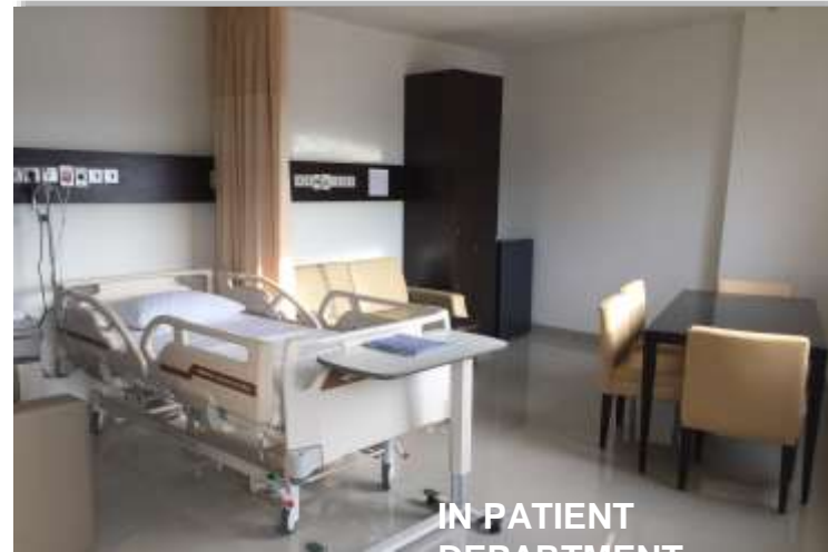
IN PATIENT DEPARTMENT