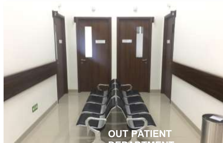
OUT PATIENT DEPARTMENT