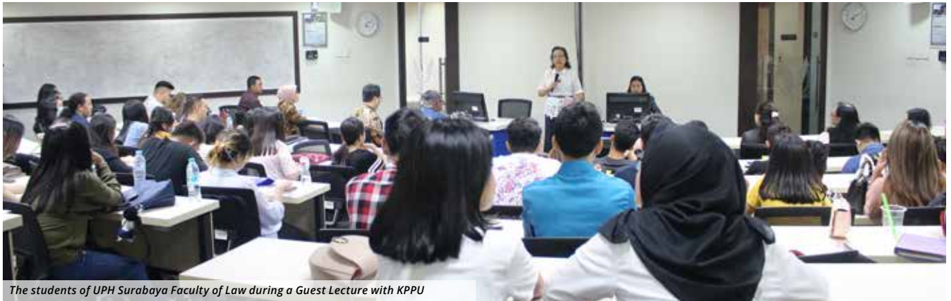
The students of UPH Surabaya Faculty of Law during a Guest Lecture with KPPU