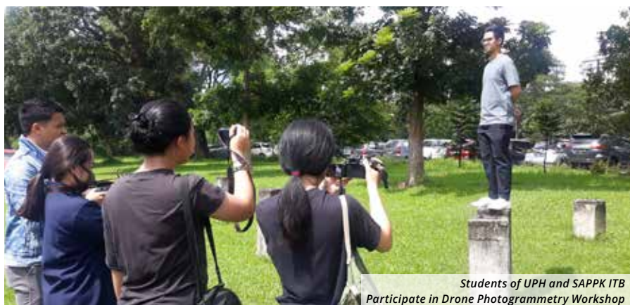
Students of UPH and SAPPK ITB Participate in Drone Photogrammetry Workshop