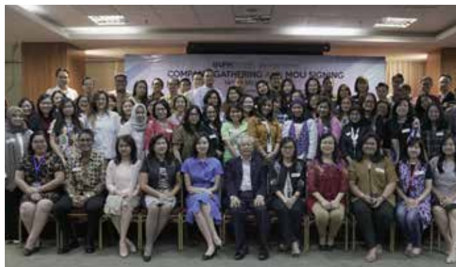
Rector and UPH Leaders with All Partnering Industries in a Photo Session after the Company Gathering in UPH

The 'Independent Campus' program promoted by the Minister of Education and Culture has been implemented by UPH and is being improved every day. As a campus that fully supports this policy, UPH believes that the collaboration between educational institutions and the industry becomes very important in order to prepare work-ready and professional graduates. The Career Center & Corporate Relations Department of UPH has partnered with more than 50 companies in various fields and has frequently held Company Gathering. In this particular Company Gathering, UPH officially added 12 industries to its list of partnering industries through a signing of Memorandum of Understanding (MoU) on February 14, 2020, at the MYC MPR building of UPH Lippo Village.