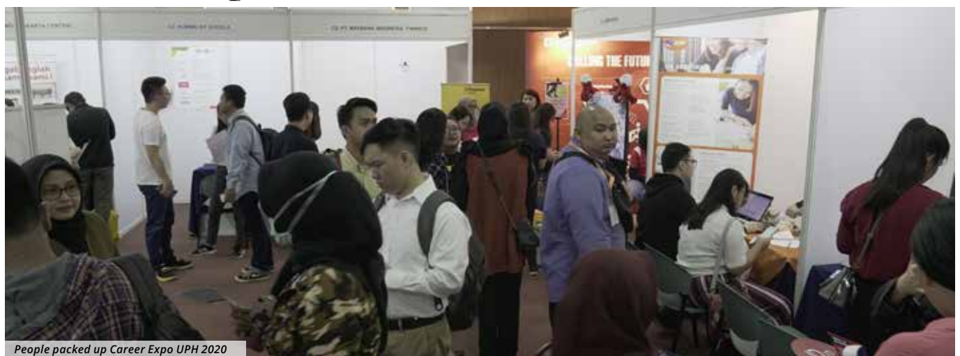
People packed up Career Expo UPH 2020

The contribution of Universitas Pelita Harapan (UPH) can be felt by many, not only UPH students and fresh graduates but also the public. This has been proven through an event called Career Expo UPH 2020: "Make Your Own Way", with a total of 50 companies engaged in various fields and business lines who are ready to meet job seekers, both UPH graduates as well as the public. This event was held on February 14 to 15, 2020, and was attended by approximately 850 people.