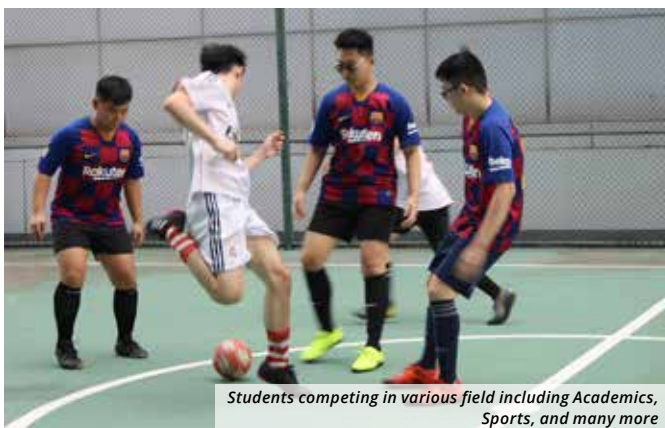
Students competing in various field including Academics, Sports, and many more