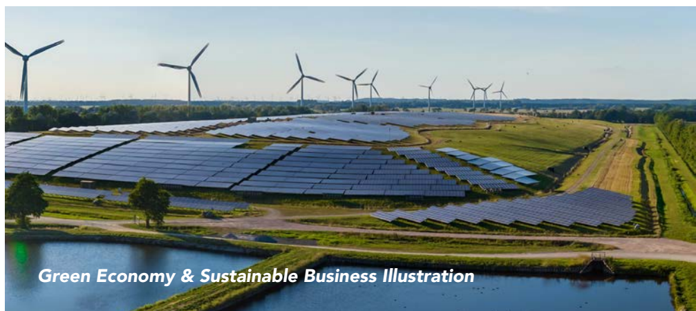
Green Economy &amp; Sustainable Business Illustration

It's really important to get a good grasp of the different business models and strategies in the renewable energy sector, like solar, water, and wind. Plus, there are some exciting opportunities out there in financing and the circular economy! These areas can be key to driving sustainable growth and making a positive impact.