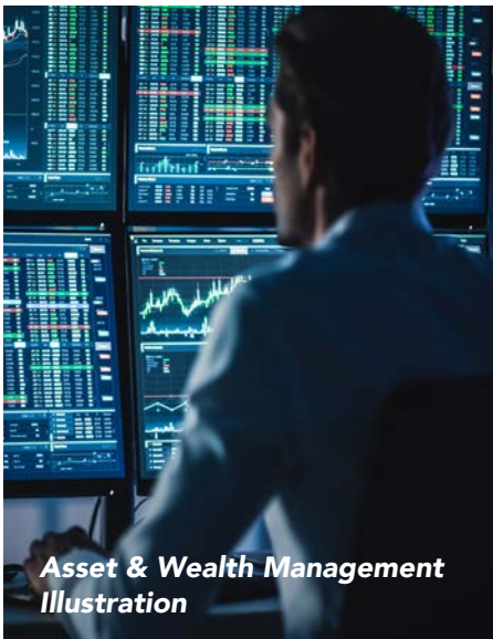
Asset & Wealth Management Illustration

Explore the exciting world of asset & wealth management into the philosophy, portfolio & investment strategy, and discover how to create innovative business models and build awesome distribution channels. Let's get started on this creative journey together!