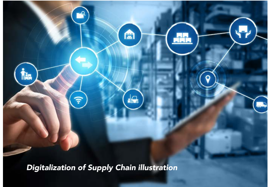
Digitalization of Supply Chain illustration

Embracing technology to transform the supply chain is a thrilling venture that spans across various industries like mining, agriculture, and manufacturing! This digital revolution is not just about keeping up; it's about skyrocketing efficiency and unleashing unprecedented productivity. Get ready to witness the dynamic changes that will reshape our world!